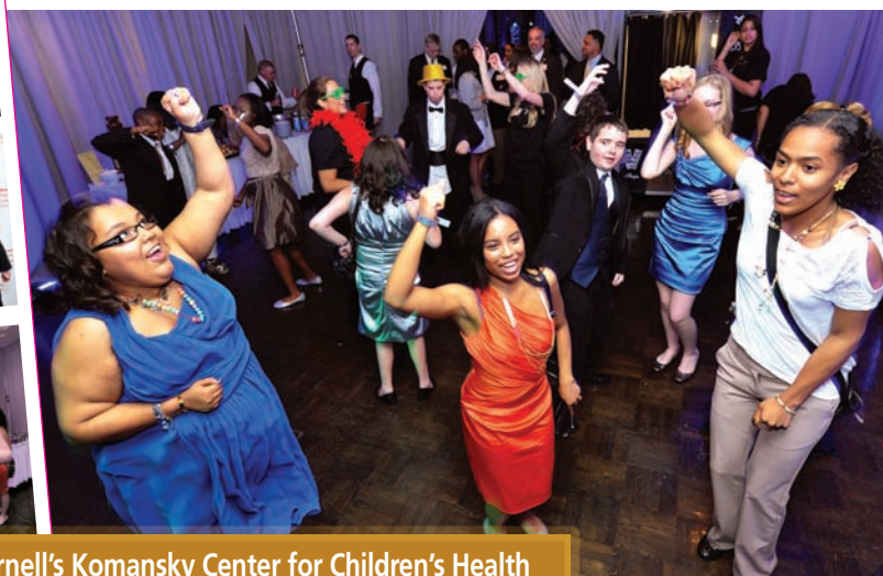
NYP/Weill Cornell's Komansky Center for Children's Health