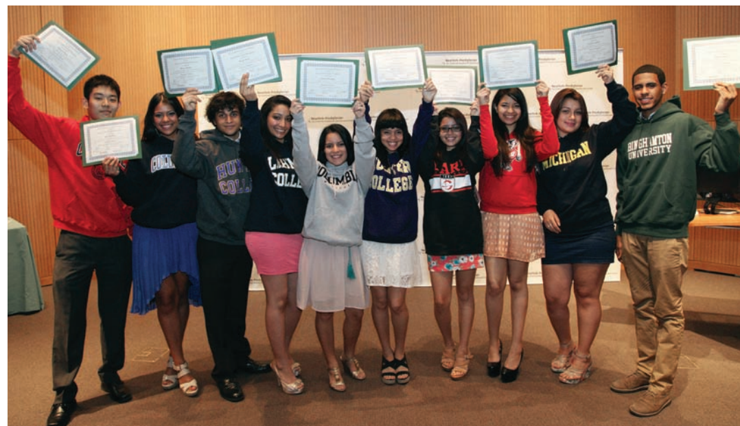
Wearing the sweatshirts of the colleges they will attend, jubilant graduates of the Lang Youth Medical Program held their diplomas high.

Their hard work has paid off. The 10 have been accepted at four-year colleges and received scholarships and grants totaling more than $445,000.