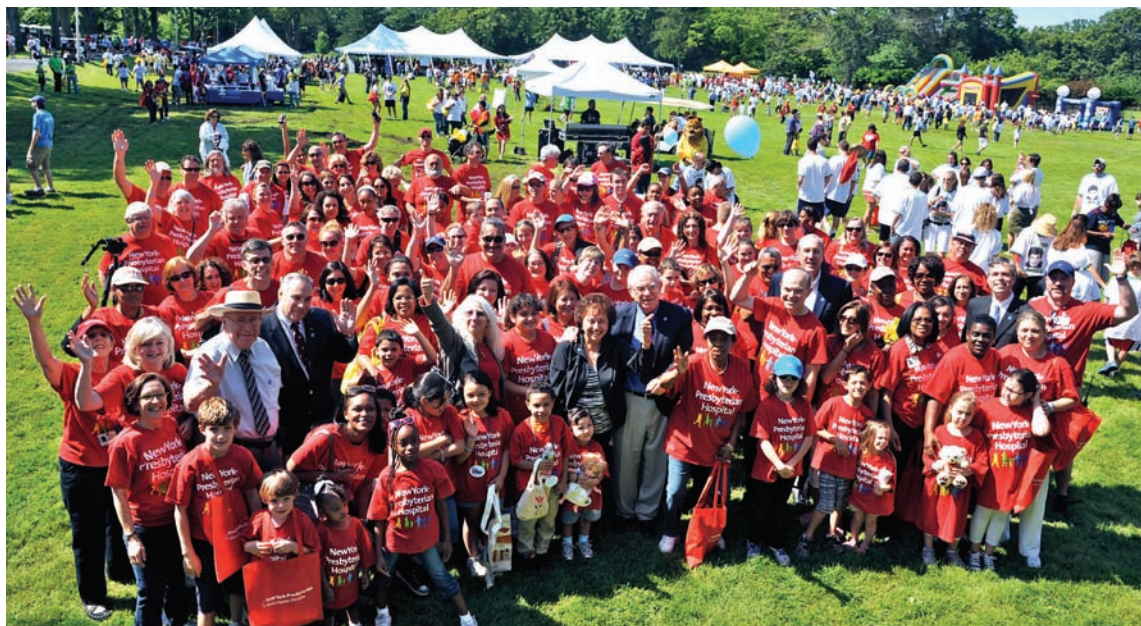
The 15,000 individuals who participated in the Westchester/Fairfield Walk Now for Autism Speaks event walked two miles on the bucolic grounds of NYP/Westchester.