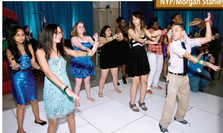
NYP/Morgan Stanley Children's Hospital