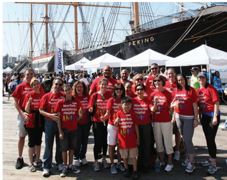
The tall ships of the South Street Seaport Museum served as a backdrop for the NYP contingent in the Walk Now for Autism Speaks event in lower Manhattan.

NYP staff also took part in a Walk Now for Autism Speaks Walk held on June 3 at the South Street Seaport.