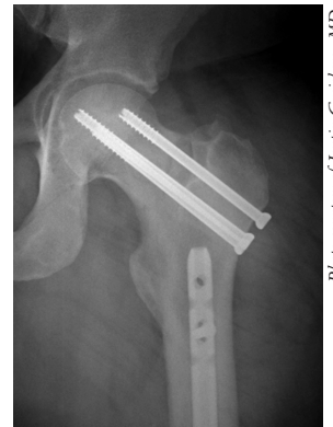
X-ray of the knee of an accident victim. Orthopaedic traumatologists at NewYork-Presbyterian/Columbia reduced the femoral neck, performed a capsulotomy, and stabilized the fracture with 3 screws.