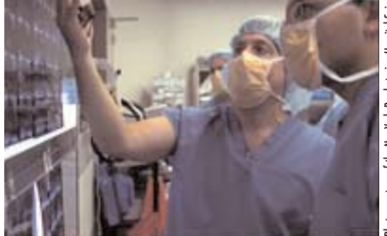
Navigational technologies such as MRIs assist surgeons in the use of minimally invasive techniques for spine surgery.

At NewYork-Presbyterian/Weill Cornell, surgeons are using minimally invasive techniques to perform spinal