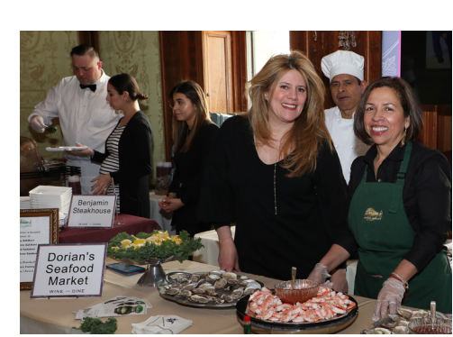
Dorian's Seafood Restaurant Team