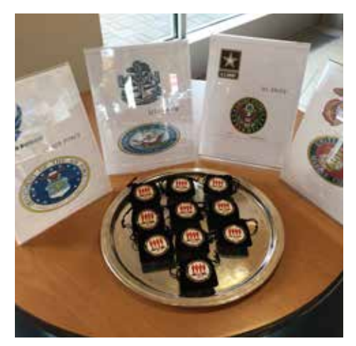
Veterans Day celebrations were held on campuses and at regional hospitals throughout NYP. Employees who are veterans were presented with commemorative coins and